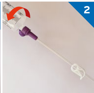
Remove the plunger from the syringe and attach the syringe barrel to the feeding tube or extension set. Close clamp