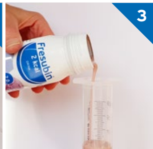
Slowly pour the required amount of feed into the syringe barrel and open clamp on tube