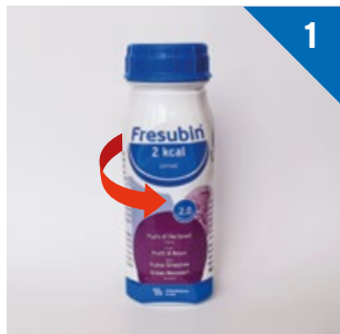
Gently roll EasyBottle